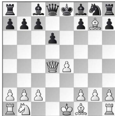
Move 6. xg7

The bishop bounces back via h6. Black is in trouble: xg7, xg7, and Black will lose a rook.