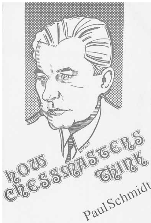
First (and only) English edition (1988), with a drawing of Paul Keres!