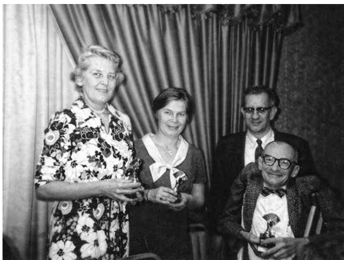
Winning team of four at Bell Labs' Bridge Club Tournament, May 1971

My father and mother took many trips together to a wide variety of destinations. They visited Washington State, Florida, Hawaii, and the Caribbean, as well as Europe to see family and friends. They also hosted my grandmother and aunt on their visit to the U.S. There