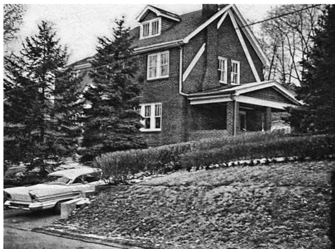
Our house in Penn Hills, near Pittsburgh, ca. 1960

At age 49, in the year 1965, my father left Westinghouse. He made the move because of disliking the aspect of his work there that had him constantly searching for government contracts to support his research. His new employer was Bell Labs 8 , in Allentown, Pennsylvania. Although promising at the time, this move introduced a dangerous element to his research: he began working with radioactive substances.