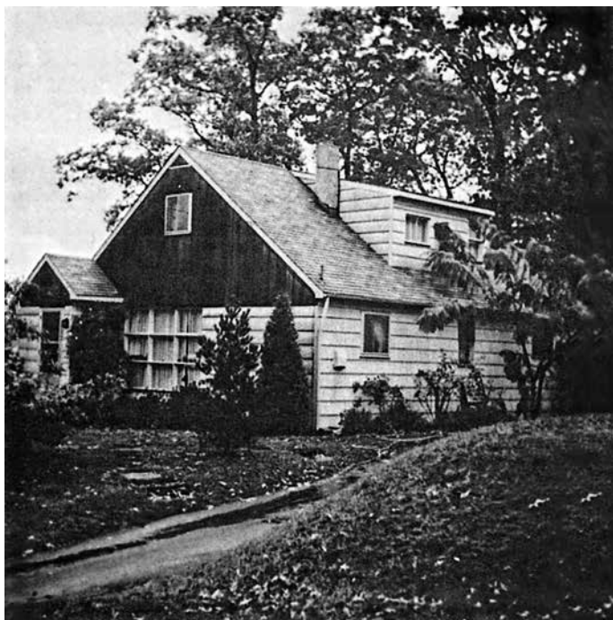
Our house in Abington, near Philadelphia, late 1950s

return every weekend, and that served to inspire in me a lifelong love of plants and the outdoors.