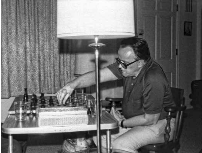
Grandmaster Ludek Pachman visiting in Allentown, July 1977. Note the dog Elsa under the table.

My father stayed in touch with a variety of chess masters in the U.S. and Europe. Most notable was the Czech and German Champion Ludek Pachman (1924–2003), who once came to visit him in Allentown.