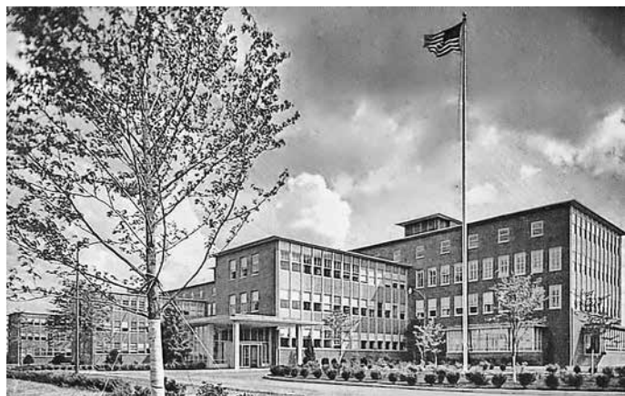
Westinghouse Research Labs, near Pittsburgh (PA), early 1960s

Life was very good for a number of years. We children were doing well in school, and financially our family was well-off. My father had bought a nice house in the Pittsburgh suburb of Penn Hills (my mother saw it only after the move), my parents had friends and acquaintances, and could afford to take nice vacations. Several years our family went on a “farm vacation” in West Virginia, and once, for two weeks, my parents visited Arizona, while we children stayed behind with a neighbor.