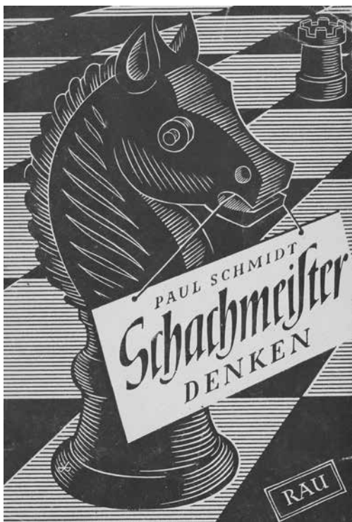
First German edition (1949)