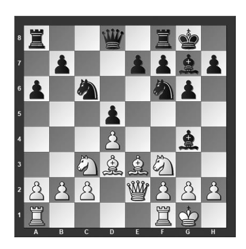
Why is 12.h3 now a mistake?