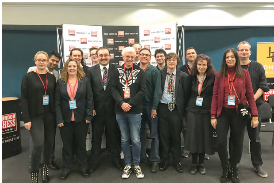
What is the collective noun for a group of fine chess arbiters, a former British Champion (John Nunn - centre, front row), and an also-ran? A gaggle of chess enthusiasts perhaps?

25...♙h2+ was in fact playable, but after 26 ♙xh2 ♖d6+ 27 ♗e5 (not 27 ♙g1 ♖xc6 and Black is a safe pawn up) 27...f6 28 b5 ♖xe5+ 29 ♖xe5 fxe5 30 ♖xe5 White is to be slightly preferred due to the weak e6-pawn and that he has a bishop for a knight in