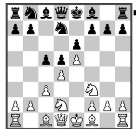
Position after: 6. c3

This line is a clever way for White to postpone his decision. It avoids the 5...a6 line in the IQP variations. 4... ♘f6 [4... ♘c6 5. exd5 exd5 transposes to the main line.] 5. e5 ♘fd7 6. c3