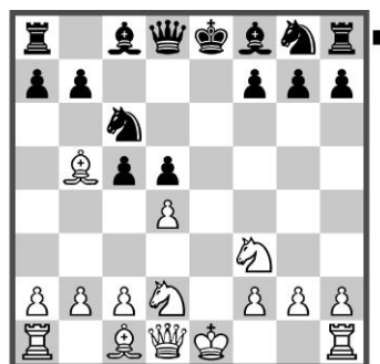
Position after: 6. ♗b5