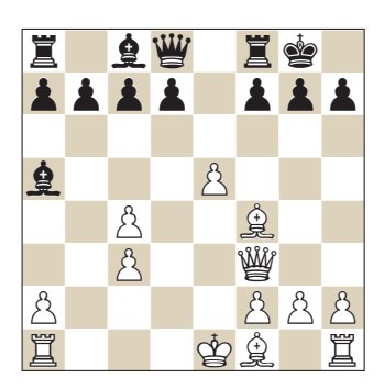
position after 10...0-0