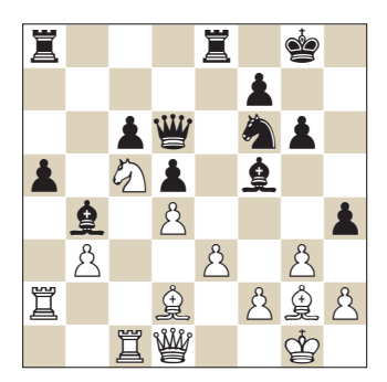
position after 20.42c5

When you think about this game from the Gashimov Memorial earlier in the year, this position springs to mind. Mamedyarov continued in traditional fashion, stepping up the pressure along the h-file, and it was