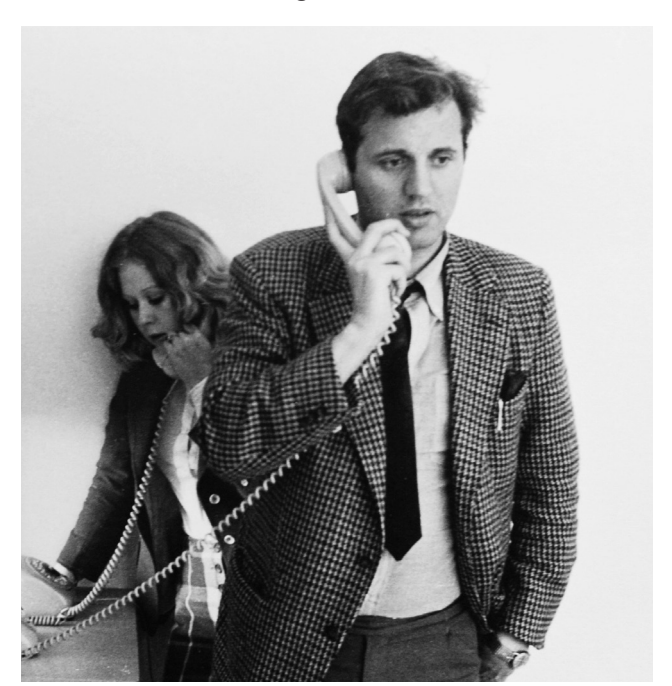
The President at work in the Federation's office in Reykjavik.

Why write another book about the World Chess Championship match in 1972? Approximately 140 books have been published about the match already, plus films, TV and radio programs, newspapers and magazine articles. To add another book to this list seemed too much to me. But many people have been encouraging me to write about the match, people working for radio and television, chess players and friends. Many have simply said: 'We still do not have a book written by someone who was working behind the scenes, where the bombs were falling.'