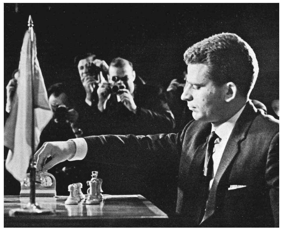
In their second World Championship match in 1969, Boris Spassky defeated Tigran Petrosian to win the highest title.

What would have happened if we had also given up? Would the match never have taken place? Would Fischer never have become World Champion? The history of chess might have taken a totally different turn. Looking back, this scenario seems highly likely. Is it possible that the optimistic Icelanders were agents of fate for chess history?